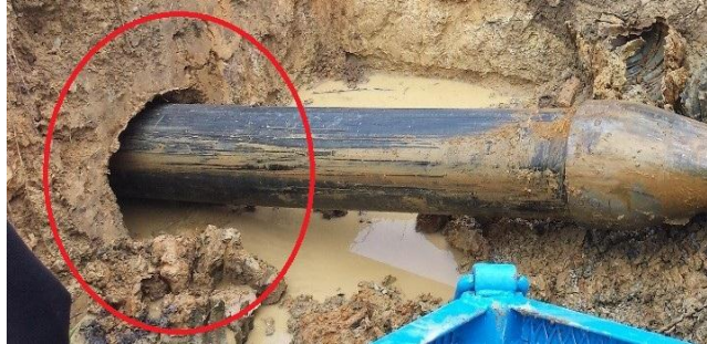
Figure 4. Overcut created by folded CMP

If the bursting head and the existing CMP are not concentric, the force applied is not evenly distributed which reduces the efficiency of the operation.