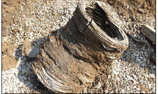
Figure 2. Compressed CMP

The main challenge is the folding effect of the CMP when it is subjected to compressive force. Under compressive force, the corrugations fold, thickening the walls of the CMP, and making it almost impossible to burst or cut. This turns the bursting operating into a "pounding" operation that pushes out the remaining section of the CMP unburst. Figure 2 shows a section of compressed CMP that was pushed out of the bore unburst. If the folding occurs early in the drive, there is a good chance that the operation will stall. Any modifications to the bursting system should be able to either burst the thickened corrugations or prevent the CMP from folding before bursting.